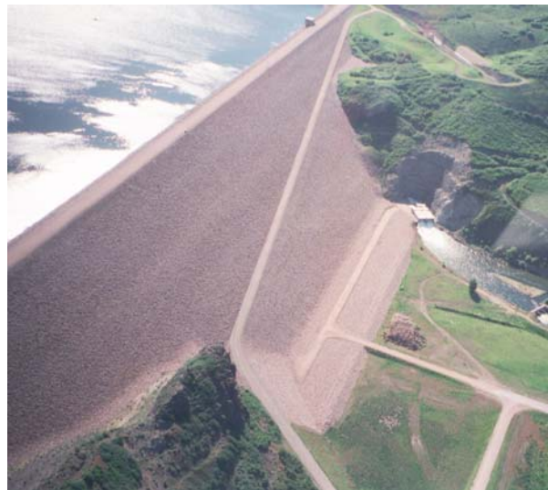
Jordanelle Hydro Certified Low Impact Hydro Facility

Please provide me with ____ blocks of Clean Green Power. Each 100kWh block is $2.95 per month.