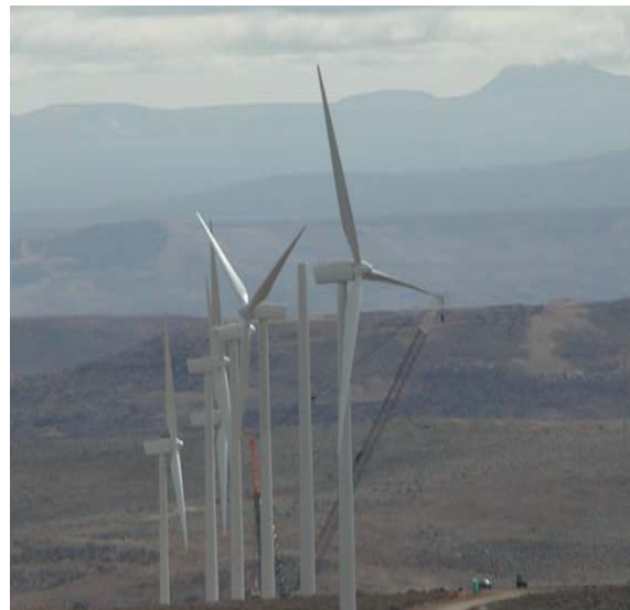
Pleasant Valley Wind Project. The City of St. George participates in this project.

Please provide me with ____ blocks of Clean Green Power. Each 100kWh block is $2.95 per month.