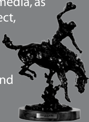
Showin' off for the Boys by Grant Speed

The mission of the St. George Art Museum is to educate all visitors through quality exhibitions from all periods, cultures, and media, as well as to collect, conserve, inventory, exhibit, and interpret art and artifacts from Utah and the West.